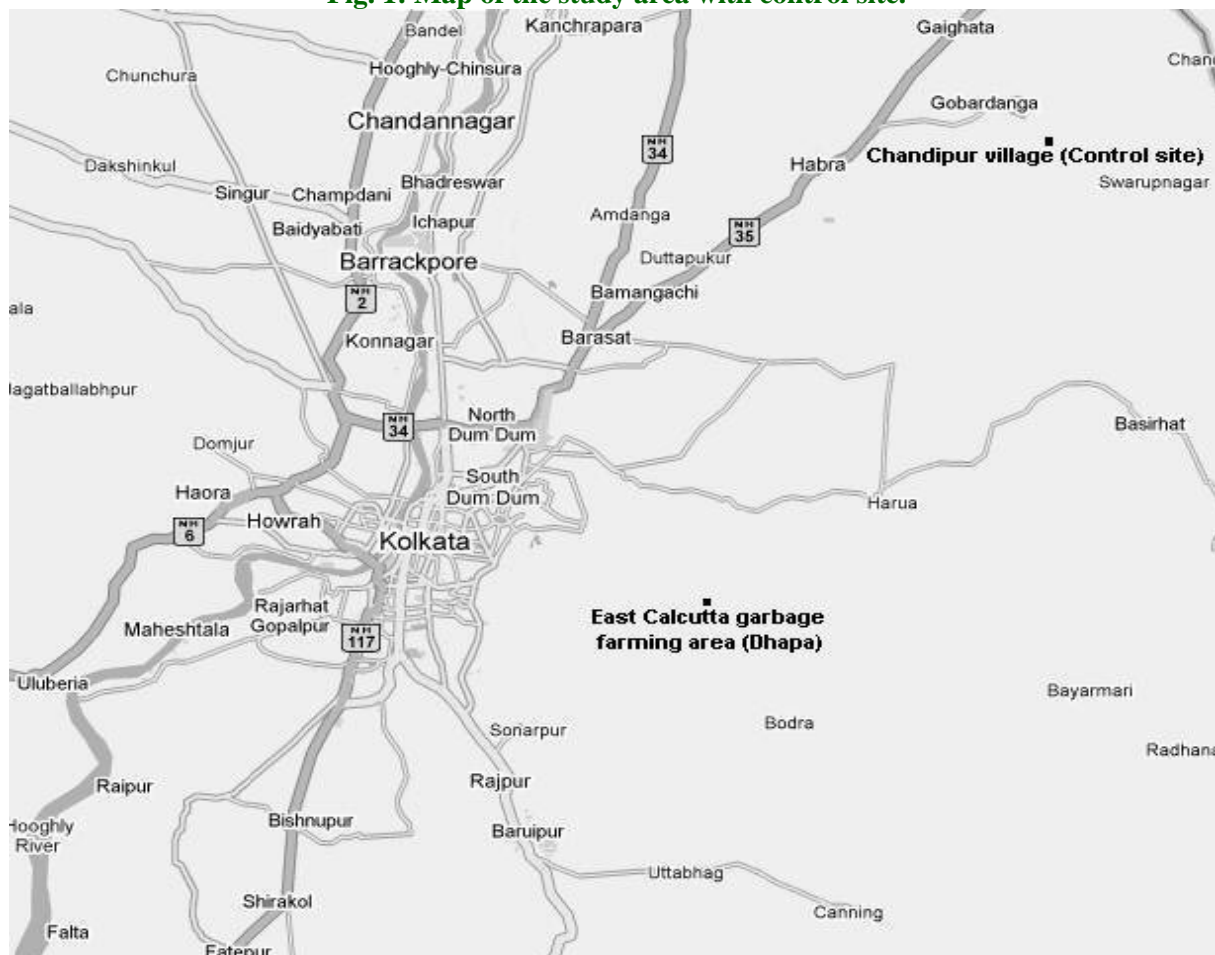
Fig. 1: Map of the study area with control site.

Chance and Machley (1955); lipid peroxidation was measured colorimetrically by using thiobarbituric acid (Rellan-Alvarez et al., 2006) and 5, 5 bis dinitro thiobenzoic acid was used to measure non protein thiol content of the vegetable extract (Ellman et al., 1961).