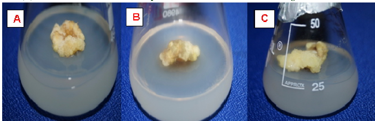
Table.1 Effect of growth regulator (BA and NAA) on callus biomass in P. hexandrum by stem explants