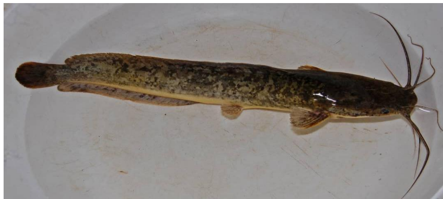
Fig. 4: Clarias gariepinus fish.