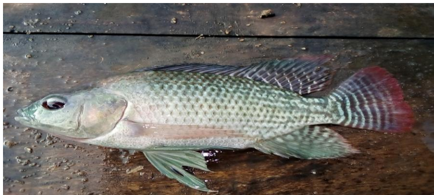
Fig. 5: Oreochromis niloticus fish.