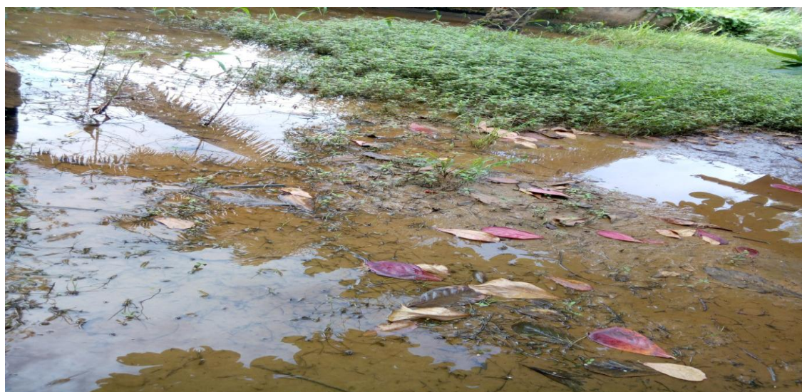
Fig. 2: A breeding site of Anopheles gambiae s.l. larvae surveyed in Dogbo district.