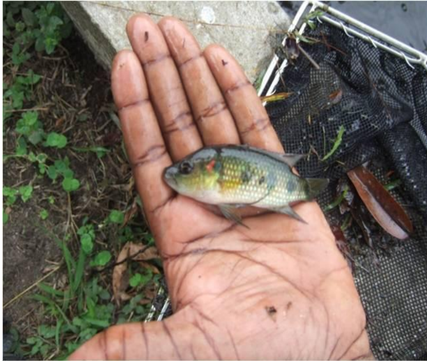
Fig. 3: Hemichromis fasciatus fish.