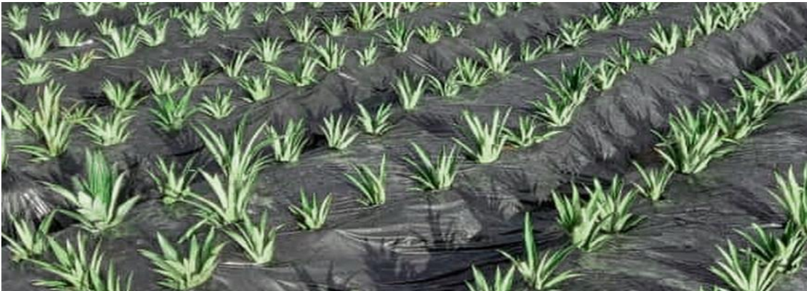
Fig. 2: Black polythene (plastic) mulching during pineapple planting.