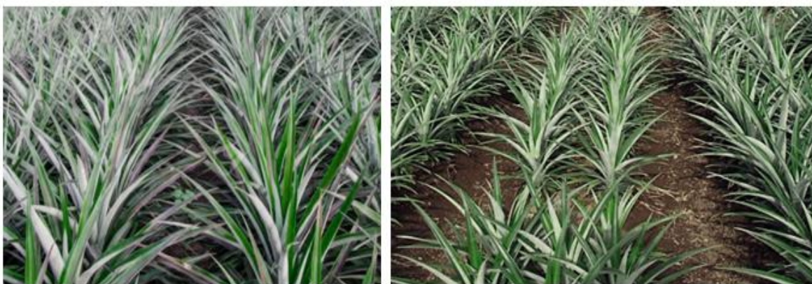
Fig. 3: Double row planting system of pineapple.