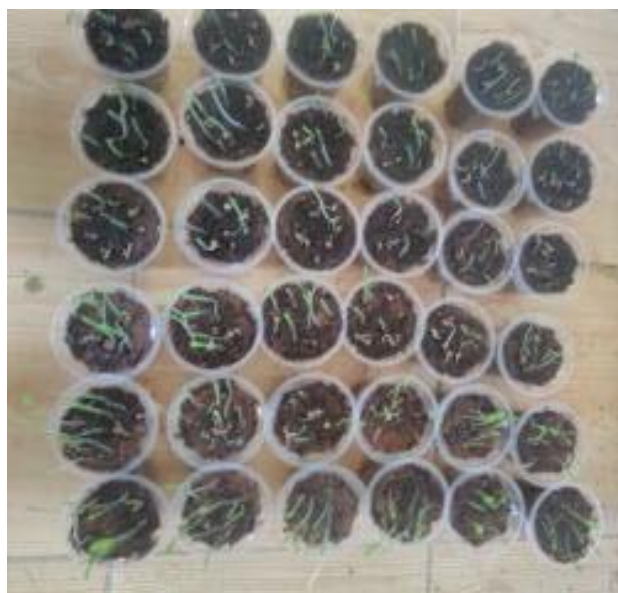
Fig. 1: Growth studies on sorghum in treated effluent.