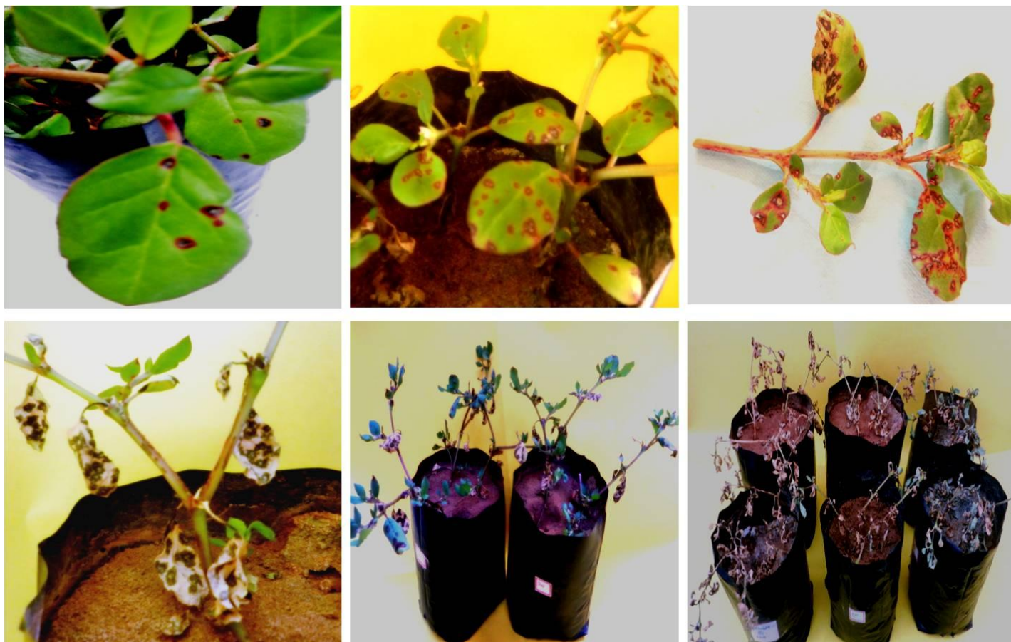
Fig. 2: Biocontrol potential of Gibbago trianthemae on horse purslane after 30 days of spore treatment.