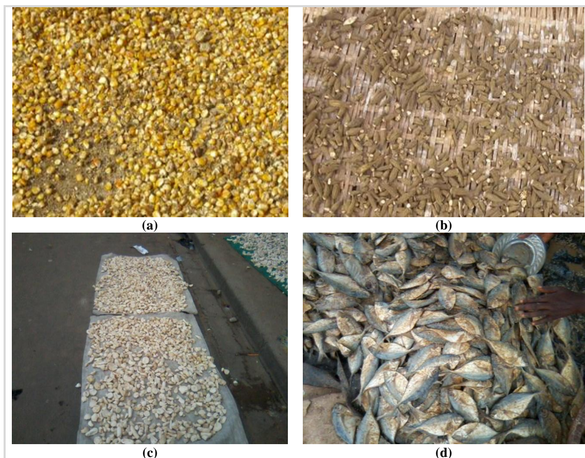
Fig. 1: Foodstuffs (a) Dry maize ; (b) Dry gumbo ; (c) Dry cassava ; (d) Fermented fish (Adjowan).

Mycotoxins (aflatoxin B1 and ochratoxin A) were searched in dry maize, dry Gumbo, dry cassava (chips) and fermented fish (adjowan) samples (Figs. 1a, 1b, 1c and 1d).