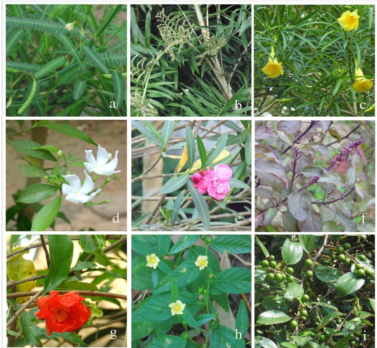
Fig. 6: Some plant species used in Bata Osha Brata (a) Aeschynomene aspera L. (b) Calamus rotang L. (c) Cascabela thevetia (L.) Lippold. (d) Ervatamia divaricata (L.) Burkill. (e) Nerium indicum Mill. (f) Ocimum sanctum L. (g) Punica granatum L. (h) Sida acuta Burm.f. (i) Zizyphus mauritiana Lam.